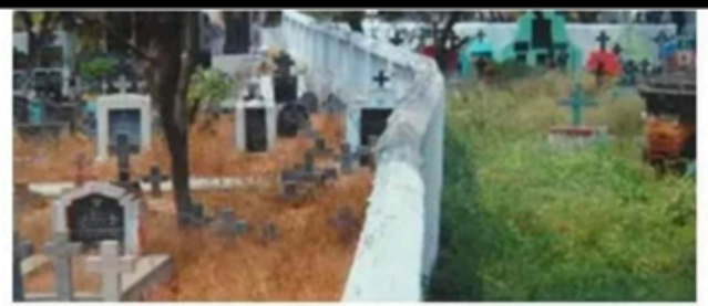
Till death do us part: Dalits are buried on the other side of the wall in this cemetery

The Anthropological Survey of India has identified 6,325 castes. A report from the National Council of Churches in India (NCCI) highlighted that caste discrimination remains prevalent in many Christian denominations in India, particularly in the treatment of Dalit Christians within church communities. Dalit Christians make up approximately 18-20% of the total Christian population in India. Despite embracing Christianity to escape caste-based oppression, practices such as segregated burial grounds and unequal treatment within church communities demonstrate the persistence of this injustice. Recent data shows alarming regional disparities, with Tamil Nadu accounting for 40-45% of reported atrocities against Dalit Christians, followed by Odisha, Andhra Pradesh, Telangana, and Karnataka. Leadership representation within the church also reflects significant inequities, with Dalit and Adivasi bishops making up only a small fraction of the total dioceses. These statistics highlight the urgent need for introspection and action to promote inclusivity and dismantle caste-based biases within religious institutions.